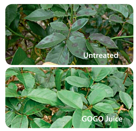
Improves Root Growth

Trials on roses resulted in significantly less foliage affected by Black Spot.