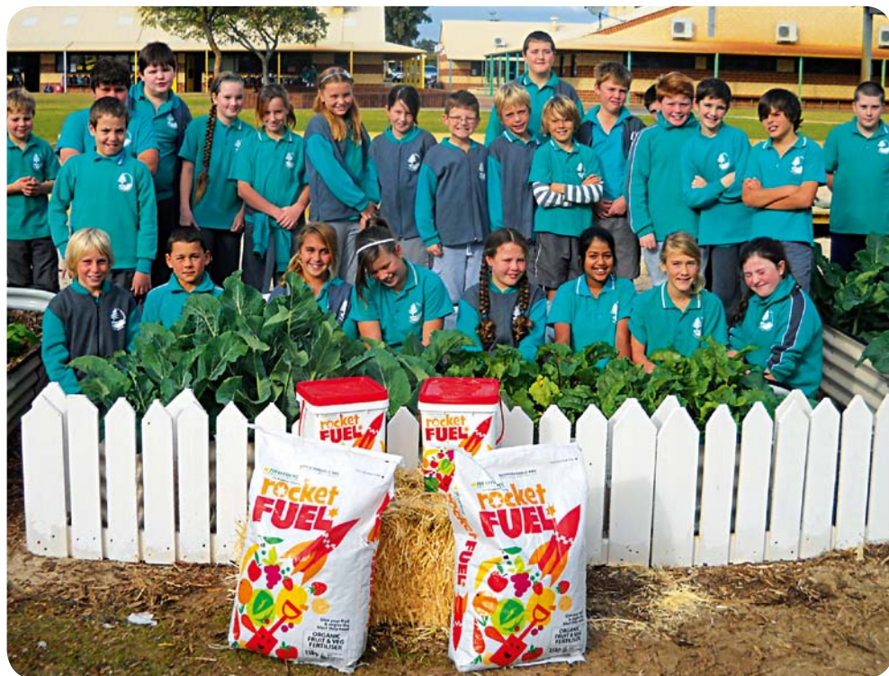
Students from the Singleton Primary School, WA

Neutrog's brand new fruit and vegetable fertiliser, Rocket Fuel, has landed at more than 140 Stephanie Alexander Kitchen Garden Program Schools around Australia.