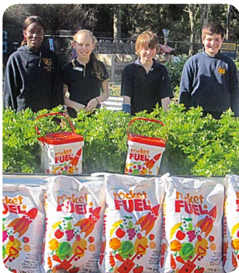
Students from the Kilkenny Primary School, SA

As part of Neutrog's partnership with the Stephanie Alexander Kitchen Garden