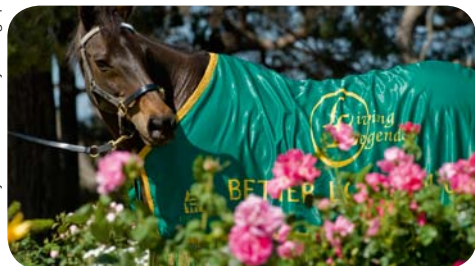
Better Loosen Up smells the roses

Living Legends is situated at Woodlands Historic Park, a unique, picturesque location that includes a historic homestead, magnificent gardens, abundant parklands and of course some of the finest retired racehorses including Apache Cat, Better Loosen Up, Brew, Dorienus, Rogan Josh, Might and Power and Fields of Omagh.