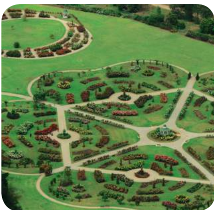
Victoria State Rose Garden

Sudden Impact for Roses is recommended and endorsed by the Rose Societies of South Australia, Victoria, New South Wales, Queensland, Western Australia and the South West Rose Group of WA along with the National Rose Society of Australia and Heritage Roses in Australia Inc.