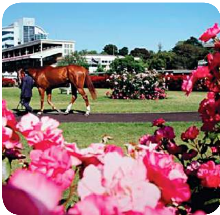
Flemington Racecourse Rose Garden

The organic raw materials are conditioned utilising a unique composting process and once completed, the water-soluble nutrients are carefully blended into the organic base before being pasteurised and pelleted.