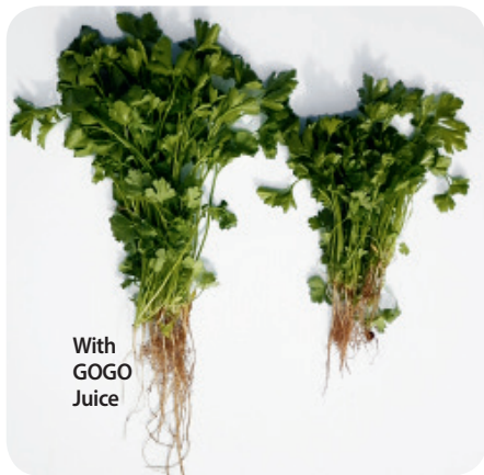
GOGO Juice trial results on parsley at Virginia in South Australia.

"Just try it" and judge its performance for yourself!